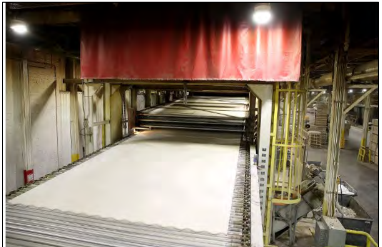
A giant sheet of ceiling tile enters into the third level of the newer of two 400-foot long dryers on site at USG in Cloquet on Wednesday morning, June 14.