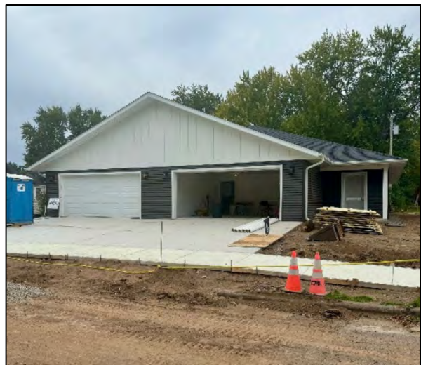
Boss Builders purchased a tax forfeit loan and in July 2024 and obtained a gap loan from the Cloquet EDA to construct a townhome. The project was completed late fall and each unit was listed for ownership sale.