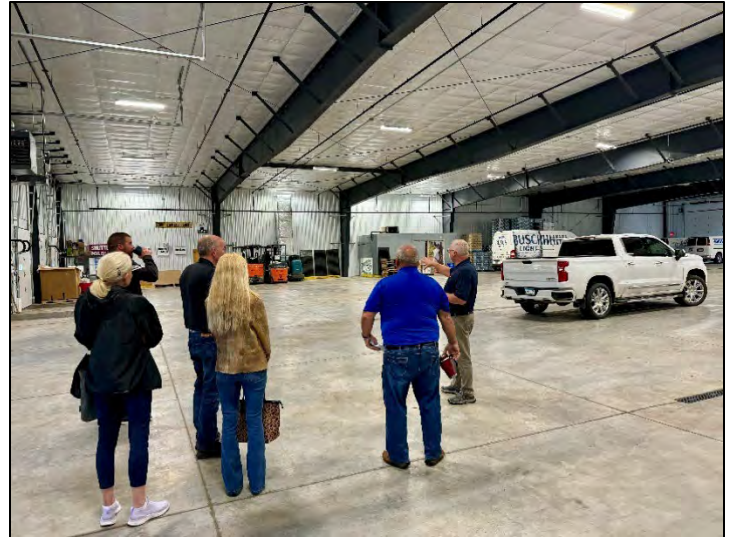
C&L Distributing completed the construction of a 22,000 square foot distribution facility in the Cloquet Business Park during 2024. The Cloquet EDA toured the facility during August 2024.